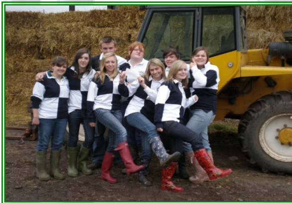
Shawbury YFC make a donation to R.A.B.I

Each year round 40 of our elderly or disabled beneficiaries enjoy the rare chance to experience a holiday