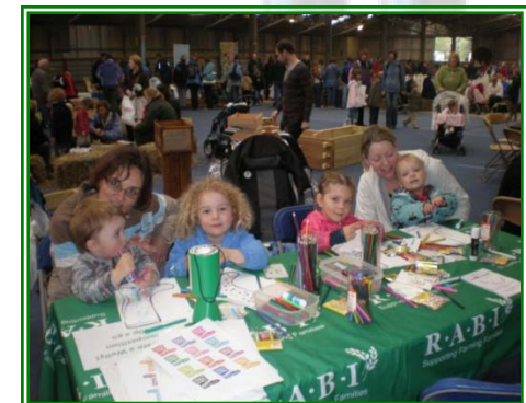
Children entering the Decorate a Welly competition at the Countrytastic Show