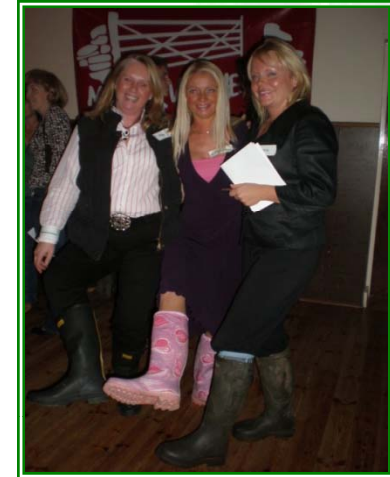
Muddy Matches members getting together for a welly good time.

From nature walks to catwalks, take to the outdoors and wear your wellies with pride. Invite a local celebrity to your event and/or get them to sign their boots for auction