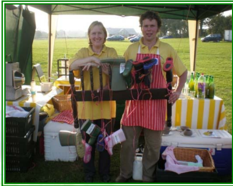
Welly 'burgometer' at the Dearnford Lake Festival